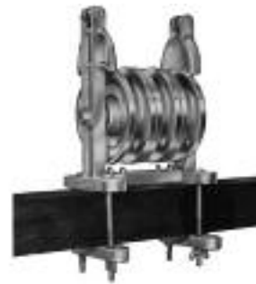
Southwire Stock # 64926101

This multi-sheave stringing block is located at the first pole. Southwire's Covered Aerial MV cables are placed in the blocks between the Roll-by Block and the conductor reels to train the conductors for ease of installation.